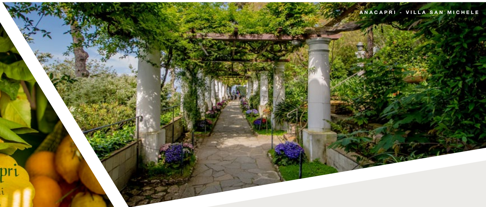
ANACAPRI - VILLA SAN MICHELE